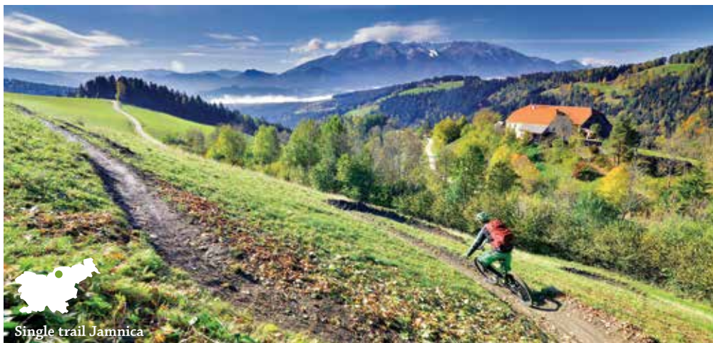
Single trail Jamnica