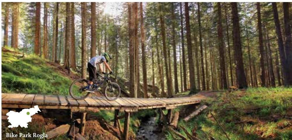
Bike Park Rogla