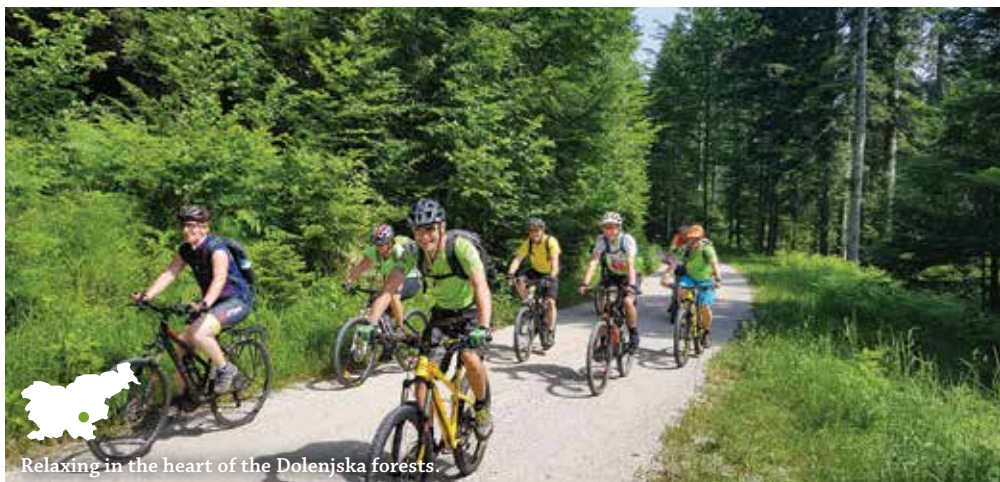
Relaxing in the heart of the Dolenjska forests.