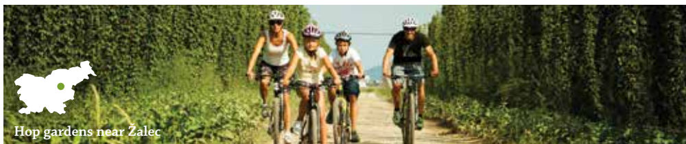
Hop gardens near Žalec

Visit Ptuj, Slovenia's oldest town, the hilly green landscapes of Slovenske Gorice and Haloze, and the wide open plains of Dravsko Polje and Ptujsko Polje. During your varied biking holiday, you can take in the diverse natural and cultural heritage of the area, and try some traditional local food with wine from one of the local vineyards.