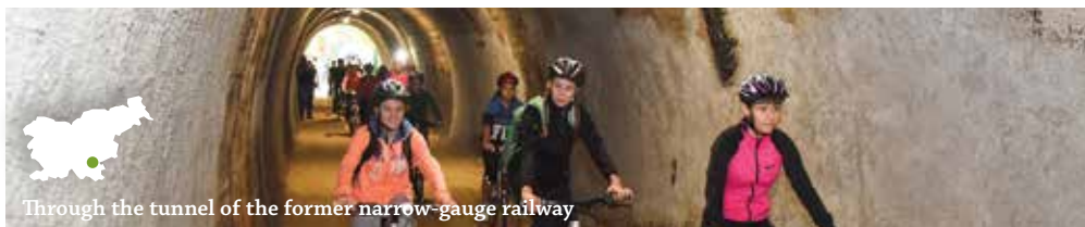
Through the tunnel of the former narrow-gauge railway